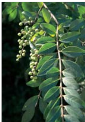
Ted Bodner, Southern Weed Science Society

grow in panicles, and small abundant fruit that range from green in summer to almost black in the fall.