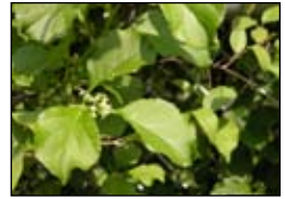
Oriental Bittersweet is an EDRR species.