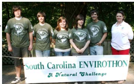
Batesburg-Leesville's Envirothon Team

Lexington County had three teams to participate in this year's Envirothon. The district sponsored two teams from Chapin High School and one from Batesburg-Leesville High School. The teams from Chapin High School finished 7th (Team 12) and 12th (Team 2), with Batesburg-Leesville's team finishing 9th. The district is proud of these teams for doing an excellent job in representing our county. Congratulations on your placements!!